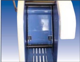
Extra-wide roll carriage

Toll Free: 800-972-4675 or 800-IPG-8273 Interpack Fax: 813-621-9680 Fax Orders To: 800-462-1293 Marysville, MI Fax: 800-368-8273 | Columbia, SC Fax: 800-462-1293 Montreal, QC Fax: 800-561-3671 | Technical Help Desk: 877-447-4832 www.itape.com | E-mail: info@itape.com